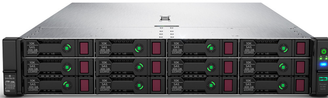
FIGURE 6-2: The HPE ProLiant DL380 Gen10.

HPE's all-time best-selling server is the ProLiant DL380, currently in its tenth generation (see Figure 6-2). Although it's usable primarily for small-scale AI deployments, the DL380 can support NVIDIA GPUs for AI training, and you can add multiple servers to a cluster as you need to expand your machine learning capabilities.