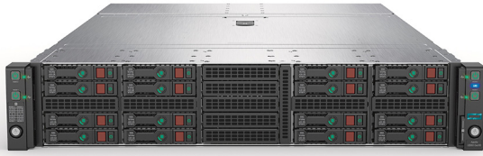
FIGURE 6-3: The HPE Apollo 2000 Gen10 Chassis.

Offering a flexible configuration, the HPE Apollo 2000 Gen10 system supports a variety of workloads, from remote site systems to large AI-centric HPC clusters to everything in between. You can deploy the HPE Apollo 2000 Gen10 cost-effectively, starting small with a single 2U shared infrastructure and scaling out up to 80 HPE ProLiant Gen10 servers in a 42U rack.