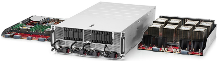
FIGURE 6-4: The HPE Apollo 6500 Gen10.