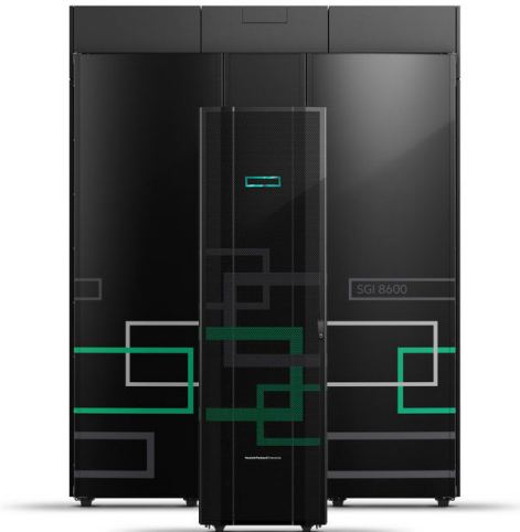
FIGURE 6-5: The HPE SGI 8600.

For petaflop-scale deep learning, HPE introduced the HPE SGI 8600 (see Figure 6-5). This liquid-cooled platform delivers leading performance, density, and efficiency and is used for extremely large training exercises. There are three compute trays, with the HPE XA780i Gen10 Server as the ideal deep learning platform used to monitor and observe data processing for pattern recognition and anomaly detection. This tray features a two-central processing unit (CPU) socket node with the Intel Xeon Scalable processors with support for up to four NVIDIA Tesla graphics processing units (GPUs) with NVLink.